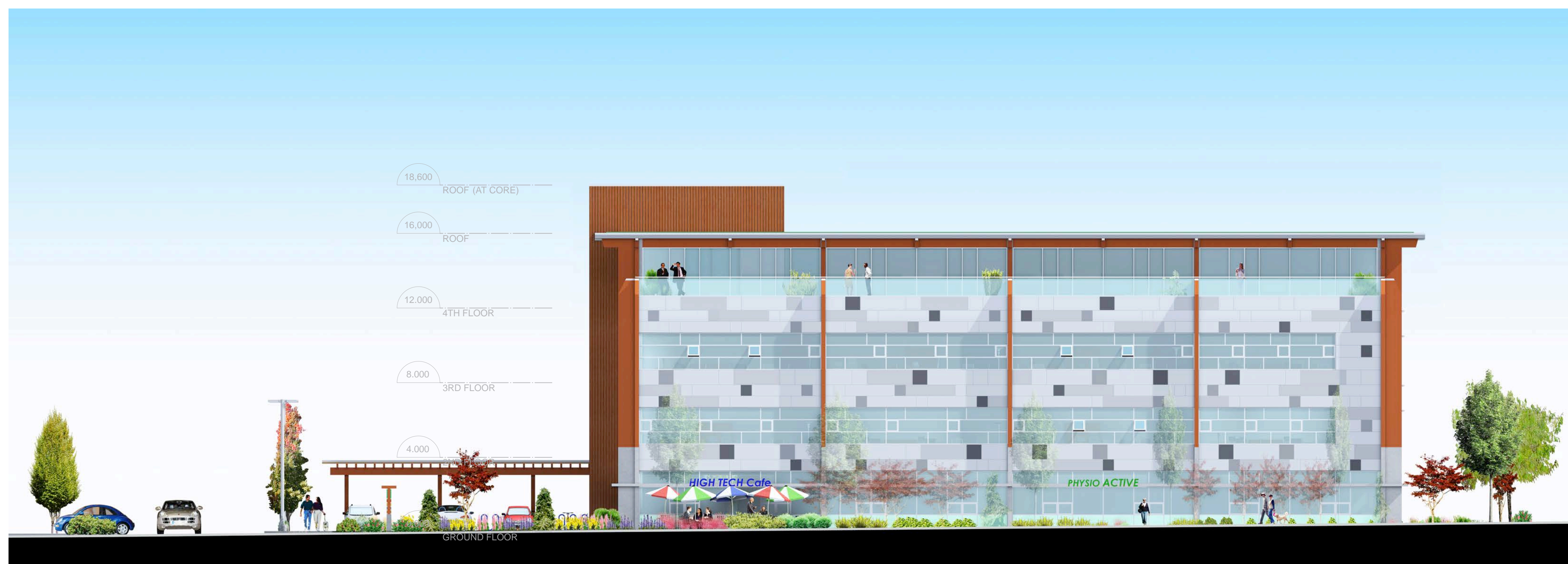
2 NORTH BUILDING - NORTH ELEVATION 1:150